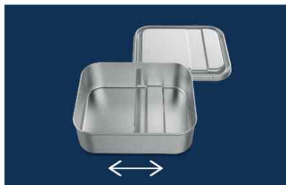
Adjustable and removable divider (800 ml)