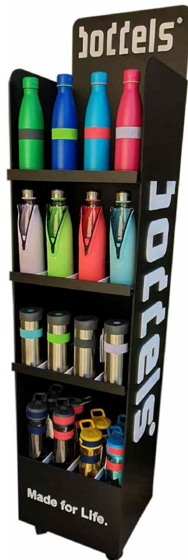
ΕΠΙΔΑΠΕΔΙΟ STAND (PVC) ΔΙΑΣΤΑΣΕΙΣ: 39 X 39 X 176 CM 64 ΘΕΣΕΩΝ