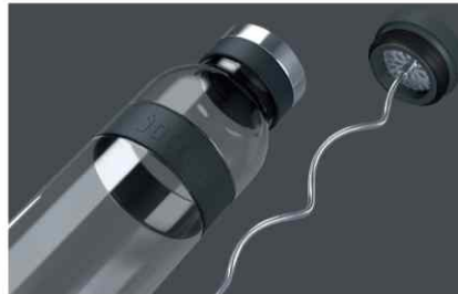
Handy fruit skewer