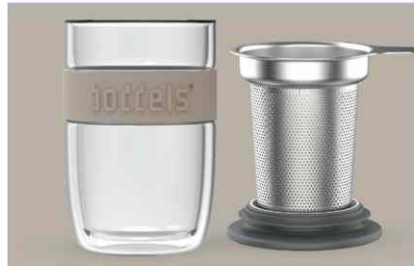
Separate ceramic lid with stainless steel sieve