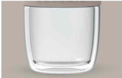
Double-walled borosilicate glass

Material: Borosilicate glass, silicone, ceramic und stainless steel