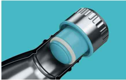
Suitable for carbonated drinks

Dimensions: Ø 7,1 cm, Height 26 cm (500 ml) / Ø 8 cm, Height 31,5 cm (800 ml) Weight: 320 g (500 ml) / 430 g (800 ml) Material: Stainless steel, PP, silicone