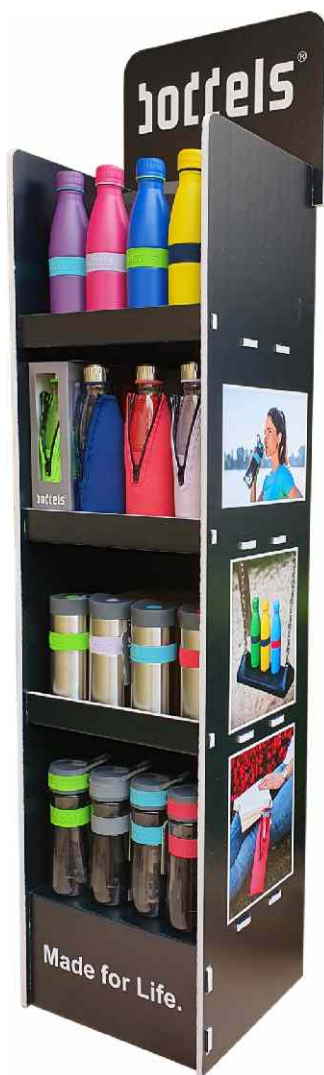
ΕΠΙΔΑΠΕΔΙΟ STAND (ΚΦΟΑΜ) ΔΙΑΣΤΑΣΕΙΣ: 33 X 36 X 165 CM 48 ΘΕΣΕΩΝ