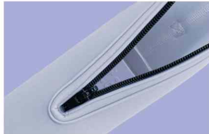
High-quality neoprene sleeve