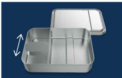
Adjustable and removable divider (1.400 ml)