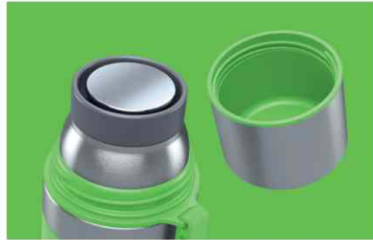
360° drinking/pouring with an integrated cup