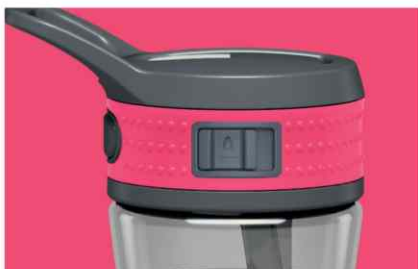
Lock and Carry - Anti-leak technology