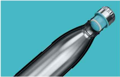
Double-walled for optimal insulation