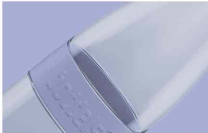
Premium borosilicate glass

Material: Borosilicate glass, stainless steel, PP, silicone, neoprene